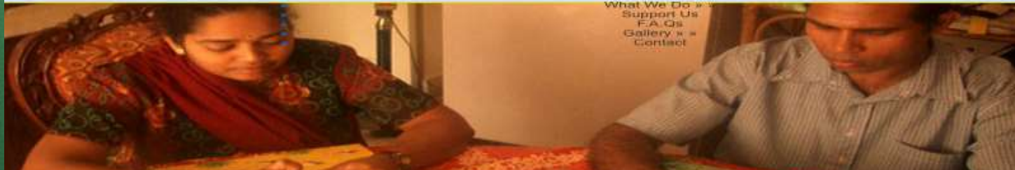
Handmade Photo Frames

Home » Who We Are » What We Do » Support Us » FAQs » Gallery » Contact »